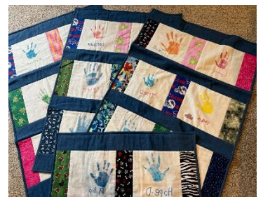
Quilted shawls made by kids during their Mission Sunday.

To date (since August 20), they have blessed 69 shawls – five of which are waiting to be given away. They will continue this ministry long after the NY Conference's Easter contest deadline but they started it as part of the Together in Love mission project that was announced at last year's Annual Meeting. It's been exciting to know that people all over NY state are working together, making one prayer shawl at a time - caring for others by wrapping them in love .