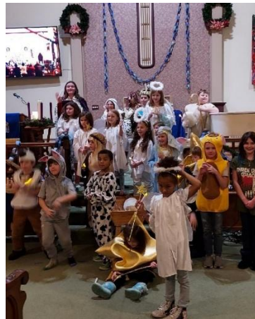
The “Imagine That!” after-school program presents a Christmas performance for their families, friends and members of Arcade UCC.