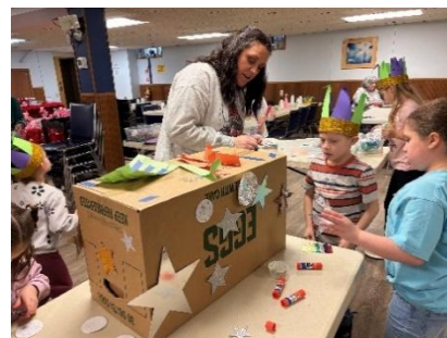
Making Mardi Gras “floats” for the parade.

A February Break Vacation Bible School was also offered at Arcade UCC. Students participated in fun and educational activities, took part in interactive Bible stories, celebrated Mardi Gras, honored Ash Wednesday, had snacks, did crafts, and much more. A fun and engaging time for all and a wonderful way to spend the break from school!